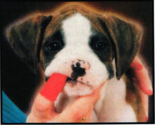
Flip The Lip

But what they are doing to this puppy is what you should do everyday. If you just took the time to run a fingerbrush under your greyhounds lip to the back it would help eliminate dental cleaning. This picture from Veterinary Practice News came with the caption: Too many veterinarians fail to routinely check patients' mouths. I have said that many times, now they have said it in their January 2005 issue of Veterinary Practice News. Actually lifting up your greyhounds lip and looking is part of our once a month obligation. Check the teeth, clean the ears, and clip the nails. That is your once a month prescription to good health.